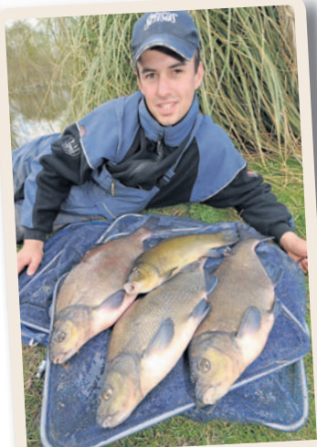
THE Carptek 11ft Feeder was more than a match for this bream trio.